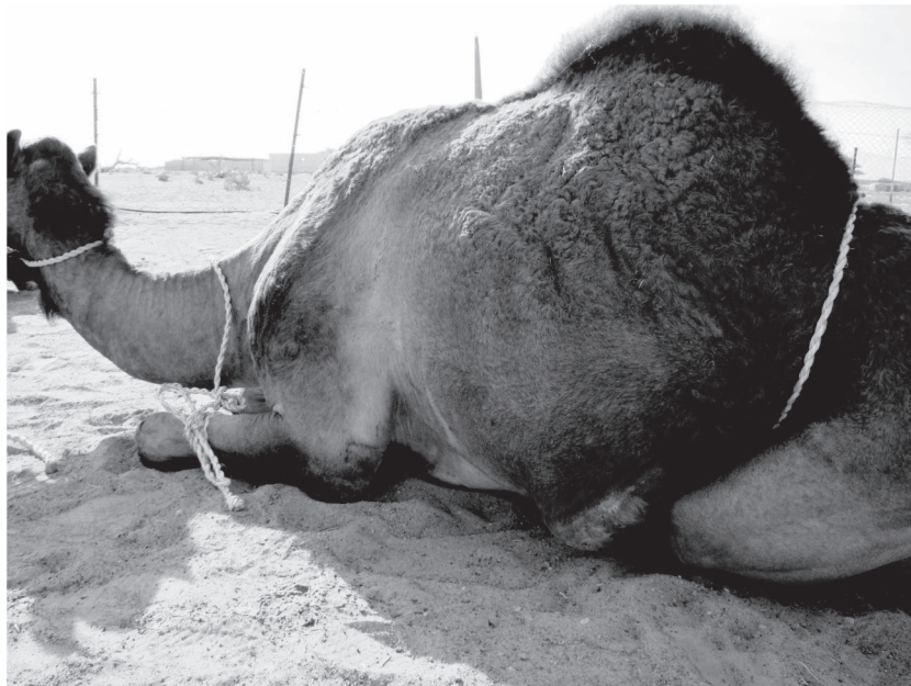
Fig 2: A female camel that developed post cesarean hernia 4 months after the operation.

Four camels died after cesarean section from 1 st to 5 th post operative day probably due to severe blood loss and development of peritonitis. The camels that died had poor general condition at the time of presentation, one of such camel was operated 10 days later after onset of 2 nd stage of labor. The fetus was dead and putrefied in this camel so the prognosis was guarded. Other camels had uneventful recovery without any complications. Skin sutures were removed as required between 20 to 36 days.