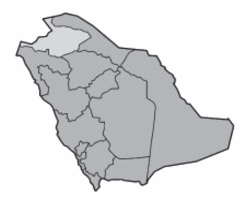
Fig. 1: Study area of T. evansi surveillance

This study was conducted in Al-Jouf province, which located in the northwestern part of Saudi Arabia between 42.37 E and 32.29 N (Fig.1). The