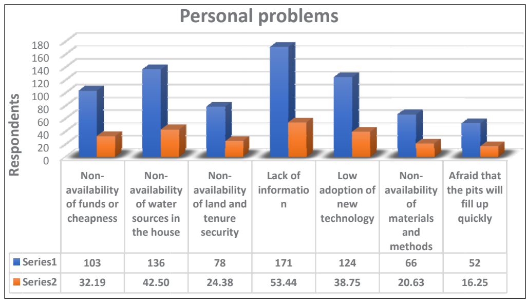
Fig. 1: Personal problems of respondents about SBM

(16.25%) respondents under afraid that the pits will fill up quickly, results were found.