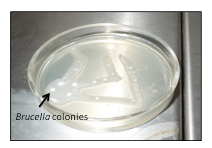
Figure 1. Brucella colonies on Brucella agar medium plate. Brucella colonies are smooth, round and glistening.

All the isolates were found positive by Rapid Slide Agglutination Test (Figure 2B).