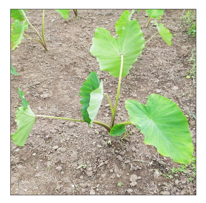
Fig. 1: Colocasia Plant

shoot, Axone and Anishi with smoked pork. Anishi cakes (Fig. 1) are prepared from the Colocasia plant ( Colocasia esculenta [L] Schott) (Fig. 2). Naga food tends to be spicy, usually with chillies, ginger and garlic. The garlic and ginger leaves are also used in the meat cooking process. Various types of food packaging, combined with different storage techniques, can be used to extend the shelf-life of meat. The causes of product deterioration are microbial spoilage, moisture loss, colour change and oxidative rancidity (Sinhanahapatra et al. , 2013).