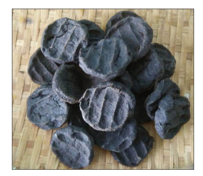
Fig. 2. Anishi cakes

Due to the paucity of information on the effect of vacuum packaging on quality attributes and shelf-life of such ready-to-eat traditional pork stored under refrigeration, the present study was intended to evaluate the quality and acceptability of traditional Naga pork products, i.e. pork with Anishi in refrigerated storage ( 4\pm1^{\circ} C) under vacuum packaging condition.