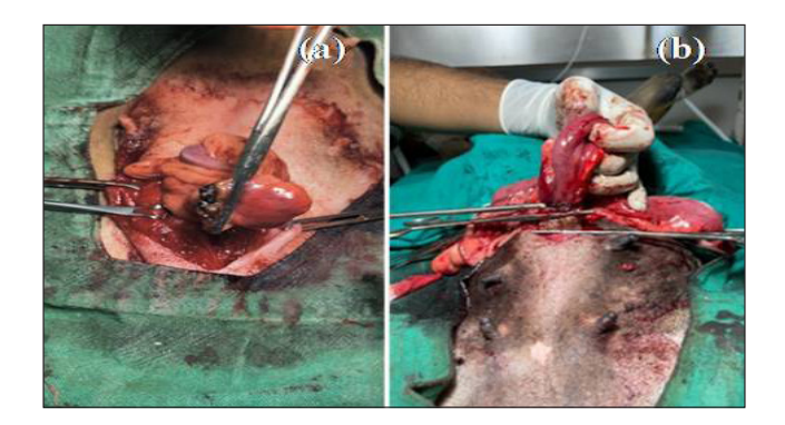
Fig. 2: Ovarian pedicle and uterine stump resected and application of electrocautery forceps (a) and (b) in Group –II

Group II: Cauterization of ovarian pedicle was done by bipolar electrocautery to control haemorrahge and pedicle was severed between the mosquito forceps. Similar procedure was followed for opposite ovarian pedicle (Fig. 2). Cranial traction was applied on the uterus, after clamping electrocautery was used through the uterine body and uterine vessels and uterine stump was resected (Bart et al. , 2003).