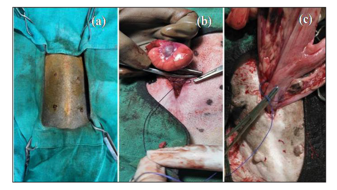
Fig. 1: Aseptic preparation of surgical site ( a ) ligation and resection of ovarian pedicle ( b ) and ( c ) in Group-I

Group I: Miller's knot ligature was placed proximal to (below) the ovarian pedicle and pedicle was severed between the mosquito forceps and the similar procedure was followed for opposite ovarian pedicle (Fig. 1). Cranial traction was applied on the uterus. After clamping Miller's knot was applied through the uterine body using the point of the needle and encircling the uterine vessels on each side and uterine stump was resected (Fossum, 2013).