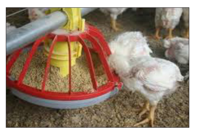
Fig. 6: Feeding