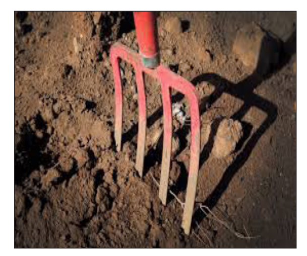
Fig. 7: Soil Mixing Fork

The Arduino UNO is used in this framework. The Arduino UNO is a microcontroller that controls the entire system.