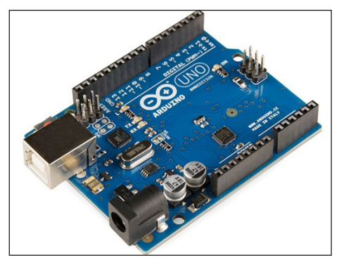
Fig. 1: Arduino Uno

clock speed. The Arduino Uno's ATMEGA328P is a pre-programmed board with a boot loader. This board enables new code to be uploaded without the use of an external hardware programmer. A singlechip microcontroller, the ATMEGA328P Arduino UNO, is used. It also uses very little fuel. Arduino boards are capable of reading inputs and converting them to output.