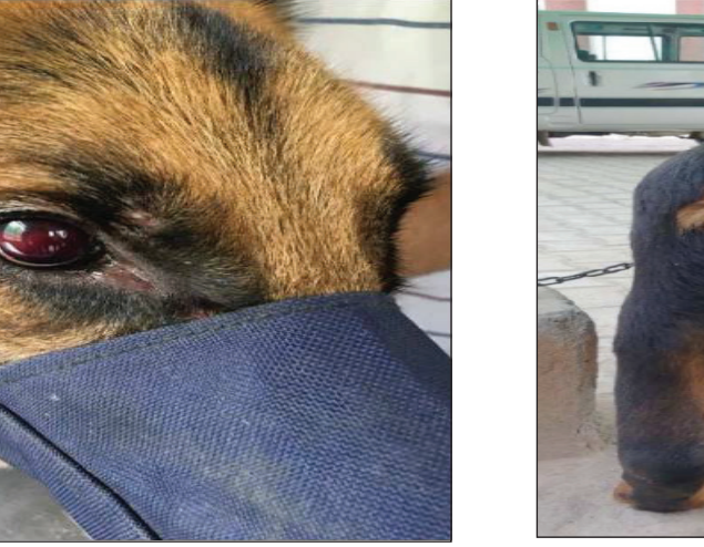
Fig. 3: Hyphema in GSD