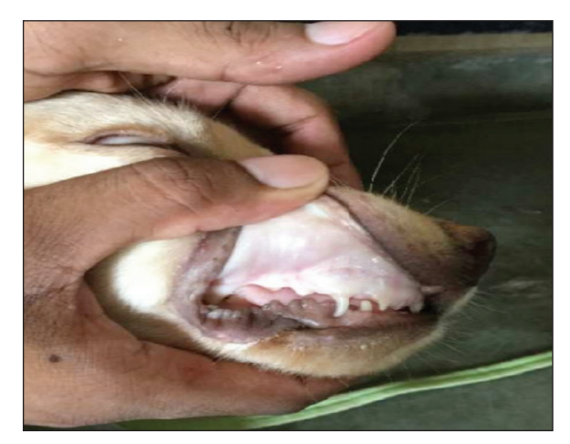
Fig. 1: Pale mucus membrane

Screening of dogs, suspected for Ehrlichiosis was done on the basis of observation of classical signs of Ehrlichia in dogs. Based on results of previous studies, clinical signs considered for screening are mucosal pallor, high fever, lymphadenomegaly, epistaxis, splenomegaly, hyphema, depression, ocular abnormalities, vomiting, haematuria, melena, haematemesis, hind limb /or scrotal edema, bleeding diathesis, icterus, central nervous system signs, ascites and weight loss (Fig. 1-4). Dogs with above mentioned 2-3 classical signs of ehrlichiosis listed above will be included in screening procedure. Dogs' positive