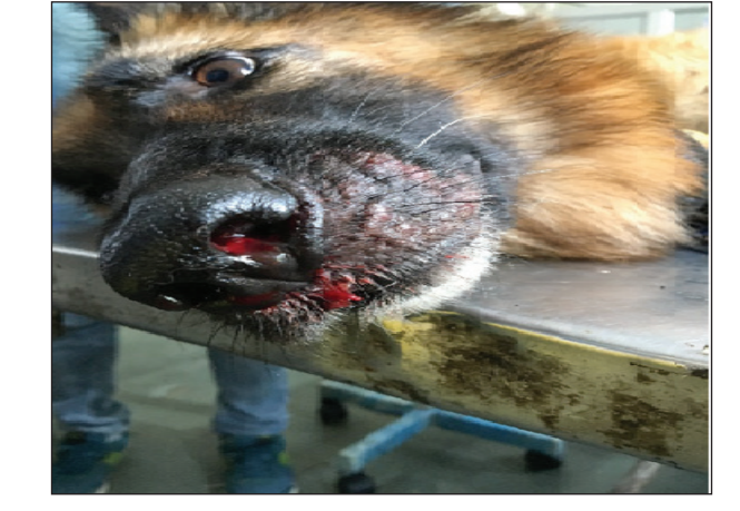
Fig. 2: Epistaxis in GSD