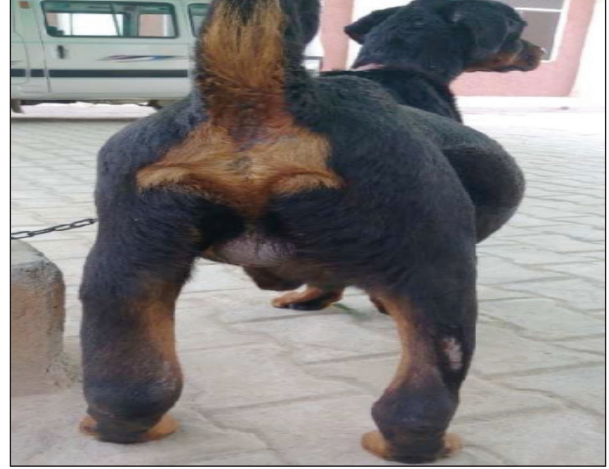
Fig. 4: Limb edema in Rottweiler