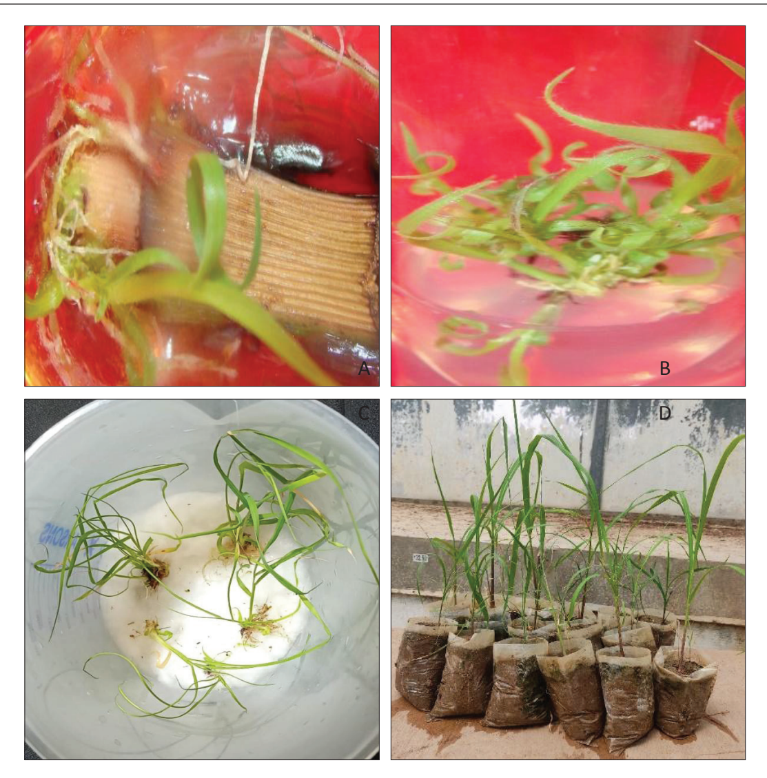
Fig. 1: Direct shoot regeneration in sugarcane (A) Direct shoot regeneration (B) Shoot proliferation (C) Hardening of plantlets (D) Transfer of plantlets to soil

the number of shoots per explants were lesser than these studies. The main differences pertain to the absence of BAP in shoot regeneration media in our study; on the contrary, we used Kinetin. Kinetin is involved in the uninuclear division of cells (Miller et al. 1961), whereas BAP leads to the cell cycle participating in cellular division. In addition, BAP contains NO<sub>3</sub><sup>-</sup> nitrogen and a NO<sub>3</sub><sup>-</sup> to NH<sub>4</sub><sup>+</sup> that affects the plant growth activity. In contrast, NAA in combination with other hormones, promotes shoot and root regeneration in parallel, as observed in our study. It was interesting to note that maximum mean shoot length was obtained in this study as compared to other studies. It can be concluded that direct shoot regeneration is affected by the nature of genotype and the optimum concentration of growth regulators.