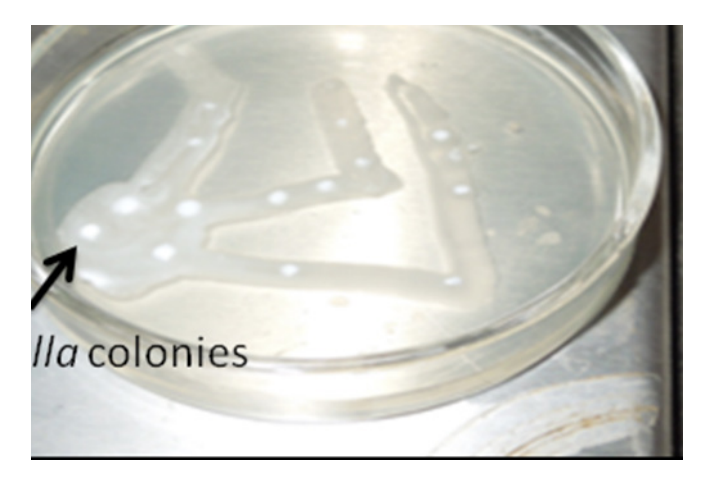
Fig. 1. Brucella colonies on Brucella agar medium plate. Brucella colonies are smooth, round and glistening.

Total ten milk samples subjected to MRT were also processed for isolation of Brucella abortus , for which Brucella agar medium (BAM) was used as a primary culture medium. From the milk samples, milk and creamy layer separately, were inoculated on BAM under 10 per cent CO_2 tension conditions for 15 days. The round, glistening and smooth colonies (Fig. 1) on of BAM were further streaked on MacConkey agar (MA). The nonlactose fermenting isolates on MA plates were presumed to be that of Brucella . Of the 20 milk samples processed, only one (10%) presumptive isolate of Brucella was obtained.