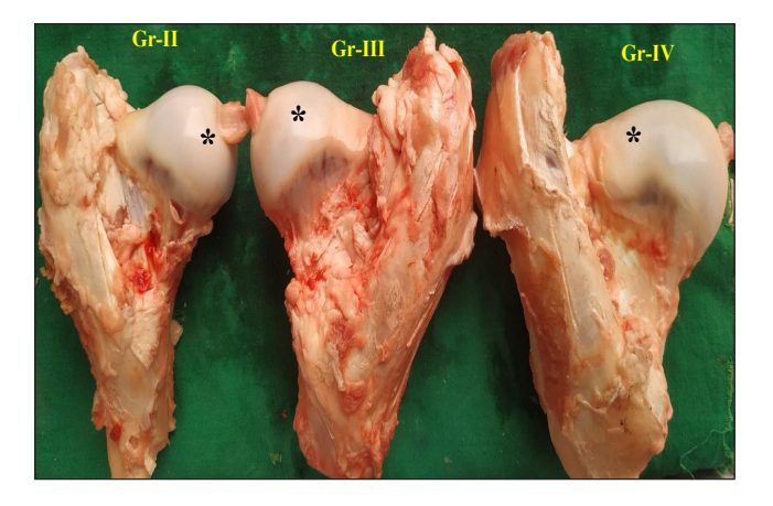
Fig. 2: Photograph showing saddle shaped AC (*) on the femoral head in Groups – II, III and IV buffalo specimens

dog, ox and horse; Kobrynczuk (1976) in European bison; Dyce et al. (2010) in domestic animals and Supriya et al. (2014) in buffalo calves. They opined that femoral head AC blended peripherally with epiphyseal cartilage and it covered the surface of the neck, merging into cartilaginous structure of the trochanter on the outside in fetuses and newborns, whereas in adults it covered only the surface of head except for its fovea.