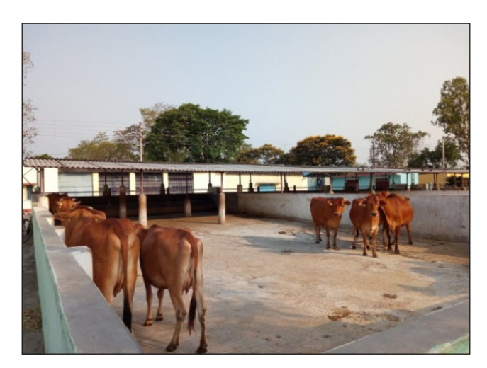
Fig. 3: Traditional shed (T_0)

environment Jersey crossbred cows showed a reduction of 170 g milk per cow per day during high stressful conditions.