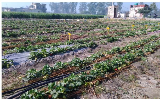
Fig. 3: Drip irrigated and mulched strawberry crop

Termites were the major pest in the experiment field. The symptoms could be characterized by wilting and drying of whole plant in 45 DAT and that could be seen near the root zone. To control the termites, chloropyriphos 20 EC along with irrigation water was applied and carbaryl @ 0.15% was sprayed to control strawberry caterpillars. Blitox @ 0.25% and Bavistin @ 0.2% were sprayed alternatively at the initial stage of growth to protect the plant from fungal attack. Straw mulching (Fig. 3) was done and low tunnels were also used to protect the crop from frost at desired time.