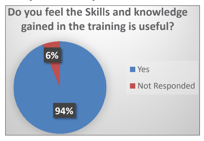
Fig. 1: Usefulness of the training

To find out the usefulness of the technical training conducted by IGNOU, a question was framed about gained the knowledge and skills are useful or not? In Fig. 1, 94% of respondents stated that gained skills and knowledge is useful and 6% respondents are responded to this question.