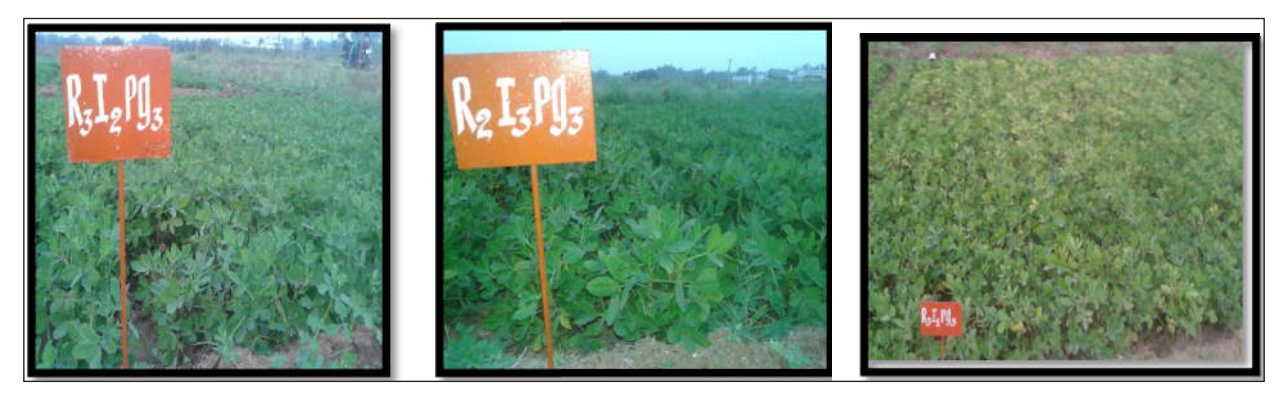
Fig. 4: Comparison between irrigation treatments I<sub>1</sub>, I<sub>2</sub> and I<sub>3</sub>