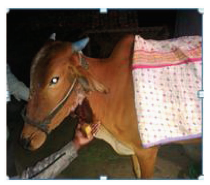
Fig. 1: Small cucumber removed by cervical oesophagotomy in a non descript cow

Oesophageal obstruction or choke is a common oesophageal disorder in cattle due