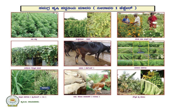
Fig. 2: A view of components integrated farming system module