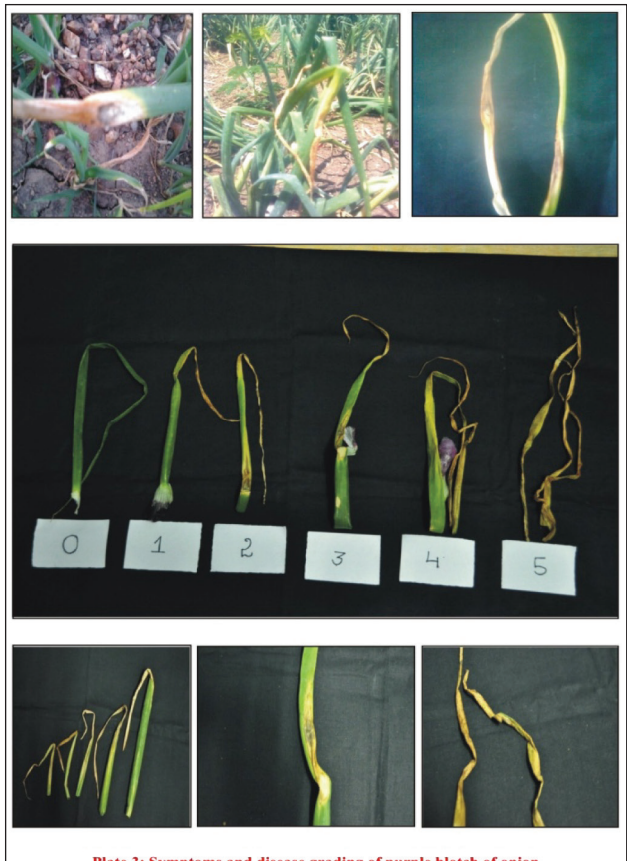
Plate 3: Symptoms and disease grading of purple blotch of onion

progressed, became oblong and a fresh zone of discoloured tissue was formed around the spots. Initially spots were white, but later turned pinkish or purple. The change in colour started from the center and gradually progressed towards the periphery, where it changed into light purplish. The transition of colour was marked by concentric rings clearly visible to the naked eye. The older leaves were more susceptible than younger leaves and were relatively more susceptible when they reach close to bulb maturity. The symptoms of the disease were photographed and are presented (Plate 3).