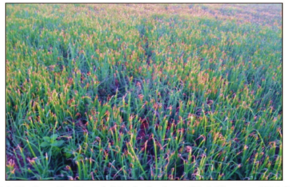
Plate 2b: Severity of purple blotch of onion at Ilkal (Hunagund Taluk)

During survey various symptoms of the disease were noticed on leaves and also on bulbs. At initial stages, leaves were with circular to oval water-soaked areas which later on, as the disease