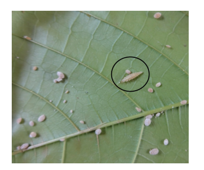
III insatr on P. citri