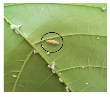
III insatr on Paracoccus marginatus