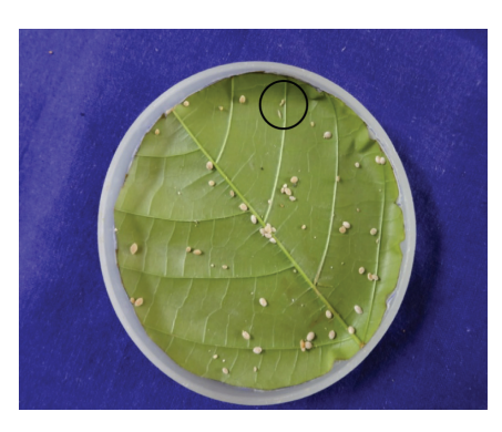
I insatr preadtor on Planococcus citri