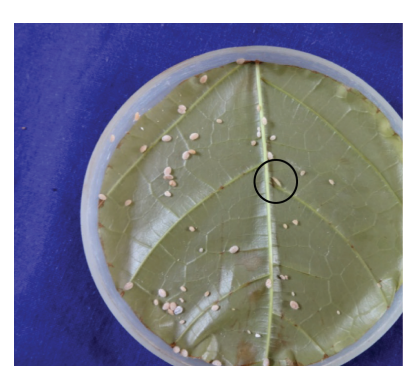
II instar predator on P. citri