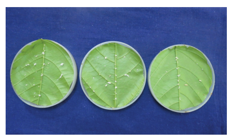
Different instars of C. zastrowi sillemi on Paracoccus marginatus

Fig. 1: Laboratory experiment on predatory potential of C. zastrowi sillemi on cocoamealybugs (round circle indicates different instars of the predator)