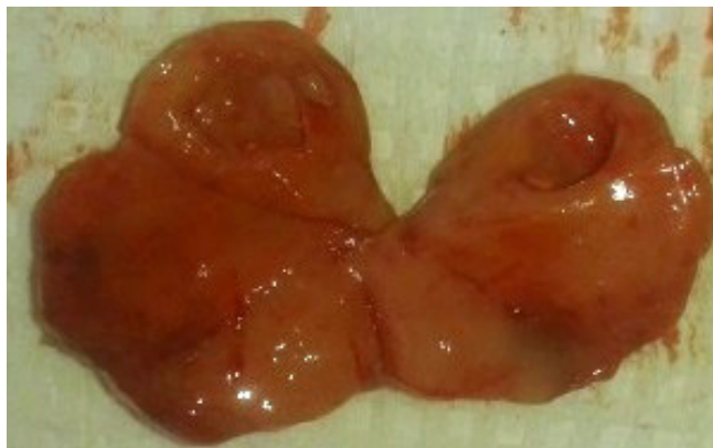
Figure 2. Encapsulated cyst dissected out from liver