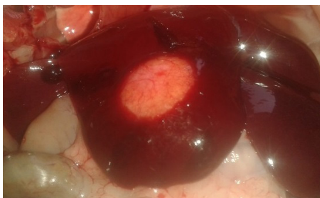
Figure 3. Cyst with irregular margins on the surface of liver in female rat