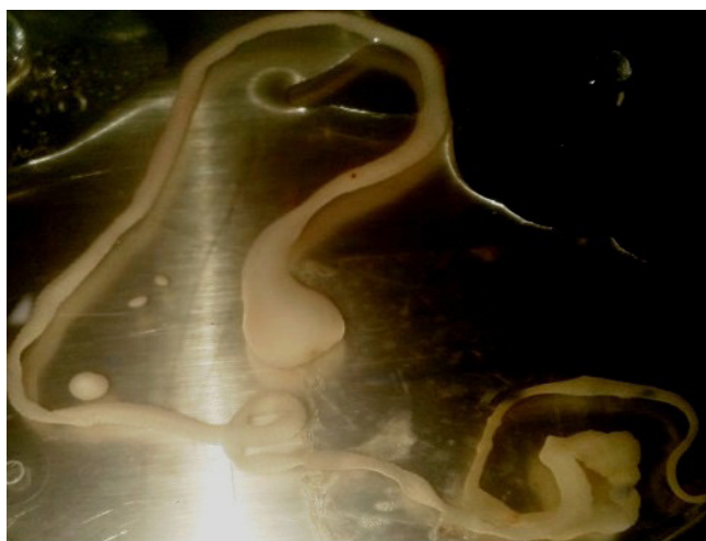
Figure 4 Cysticercus fasciolaris larvae dissected out from cyst in liver of female rat.