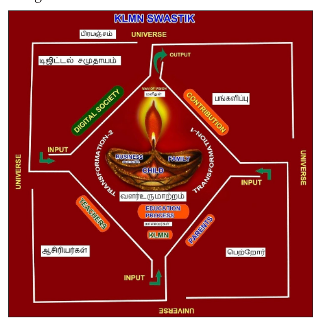
Fig. 2: (Special) Education Logo-KLMN SWASTIK

The KLMN SWASTIK is an acronym where k-knowing; L-Learning; M-mind mapping; N-New idea Contributing to the nation building and people binding from the child's nurturing. The Special Education Logo is the standard education logo that suits for all type of education namely, Google Education-Self-Learning, CWSN, Regular school Education, Home Education, NIOS-National Institute of Open Schooling, Gurukula learning for Vedic studies, Technology equipped online Education, etc., The KLMN SWASTIK teaching learning model<sup>[15]</sup> for overall development of the child can be used as a teaching strategy for bringing change and transformation in the CWSN.